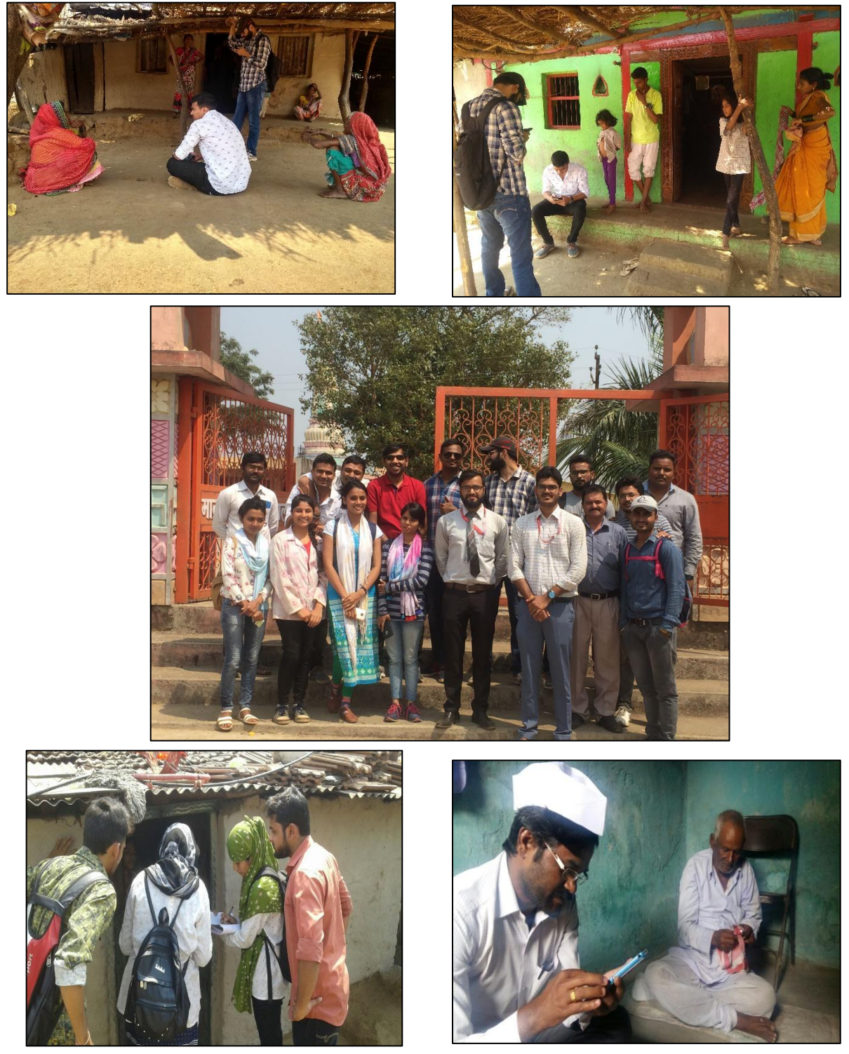
HOUSE HOLD SURVEY FOR UBA AND SAGY